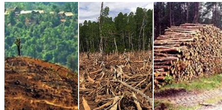
Shifting cultivation Deforestation Logging