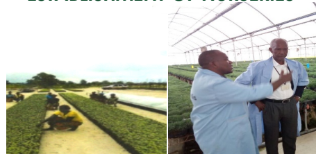
Satellite Nurseries Mechanised Commercial Nursery